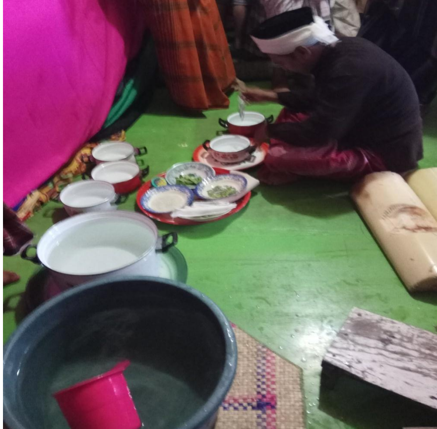
Figure 1. The Seven Containers That Have Been Mixed With Certain Materials Used to Bathing Bodies (Husnul document, photo taken, 23 February 2019)

the bath to cover the body; preparation of cloth as a veil; as well as some bamboo sticks to make stretchers.